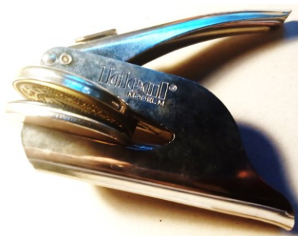
Embossing press with die in place